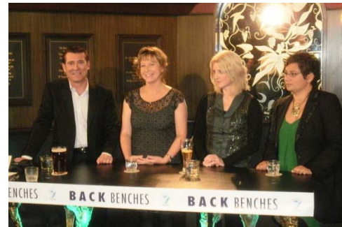
On the Back Benches show with Clare Curran, Heather Roy and Metiria Turei