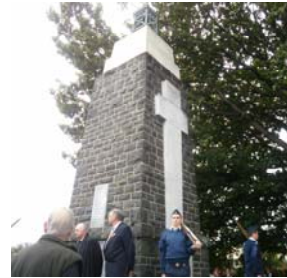
Mosgiel War Memorial

The day was marred by the tragic news of the Iroquois crash at Pukerua Bay north of Wellington. Many members of my extended family have served in the Air Force including a brother who flew Iroquois. The Defence Force will be badly affected by the tragedy but the courage, resilience and comradeship that was first forged at Gallipoli will no doubt sustain them in this difficult period. RIP.