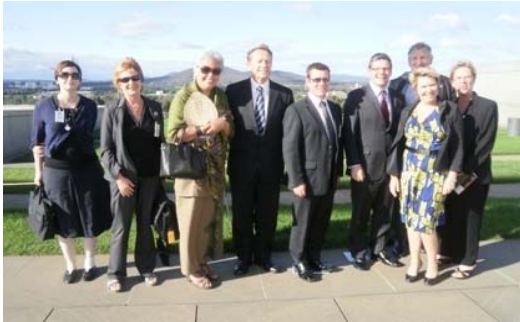
The Health Select Committee on the roof of the Australian Parliament building

We were also interested in funding structures and Prime Minister Kevin Rudd made some major announcements about future changes to their system that caused quite a stir in the health sector.