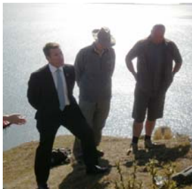
Speaking at the Otago Peninsula

I was impressed by the work the Otago Peninsula community and the Department of Conservation are doing to make sure our wildlife is protected and that the theft of our wildlife is prevented.